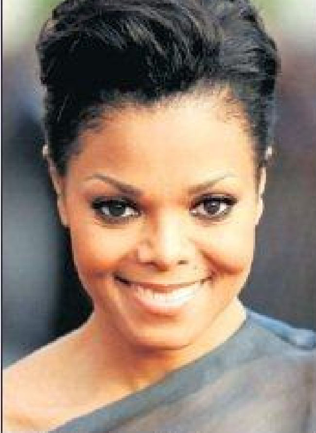
UP STYLE: Janet Jackson