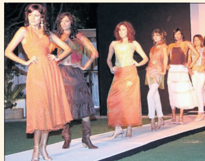
PRETTY PEOPLE: Models and soapie stars display designs from last year's fashion show.

Tickets for this fabulous fashion show cost R280.