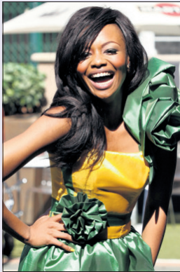
MODEL LOOKS: Television presenter Bonang Matheba had her hair 'fitted' by Diva Divine Hair.

"The hair is available in various styles and made from 100 percent pure Indian Remy hair with the cuticles (roots) still intact and facing the same direction. This