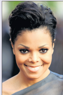
UP STYLE: Janet Jackson