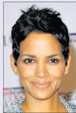
SHORT: Halle Berry

growing from the scalp and does not destroy the hairline.